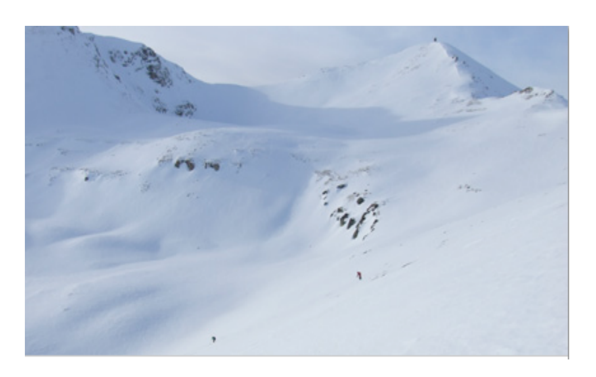
XMKD freeride covers around 30 square kilometers above 1600 m with highest peak 2747 m, offering wide choice of lines from easy 30 degree and tree runs to demanding 45 degree.